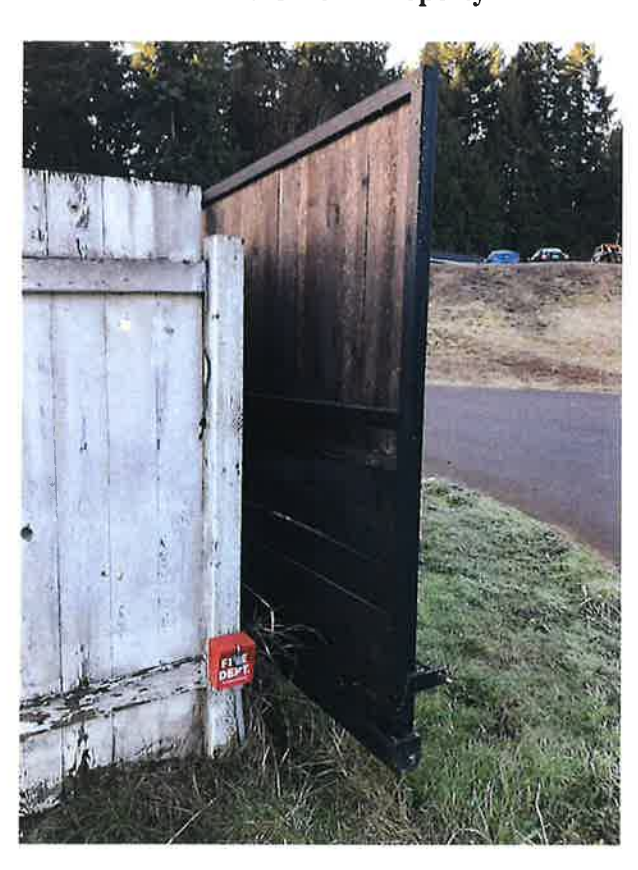
Electric Gate at Property

The submitted community letter states that the subject property has a large electric gate at the access point to Berry Hill Drive, which further causes traffic backup and turnaround issues for delivery vehicles on the road. This gate was observed and was open during Staff's site visit on 12/21/2022 at approximately 9:00 AM. The applicant states that the gate is open during business hours and has a reserve power supply in case of an outage. As can be seen in the image below, the Fire Department also has access to open this gate in case of emergency.